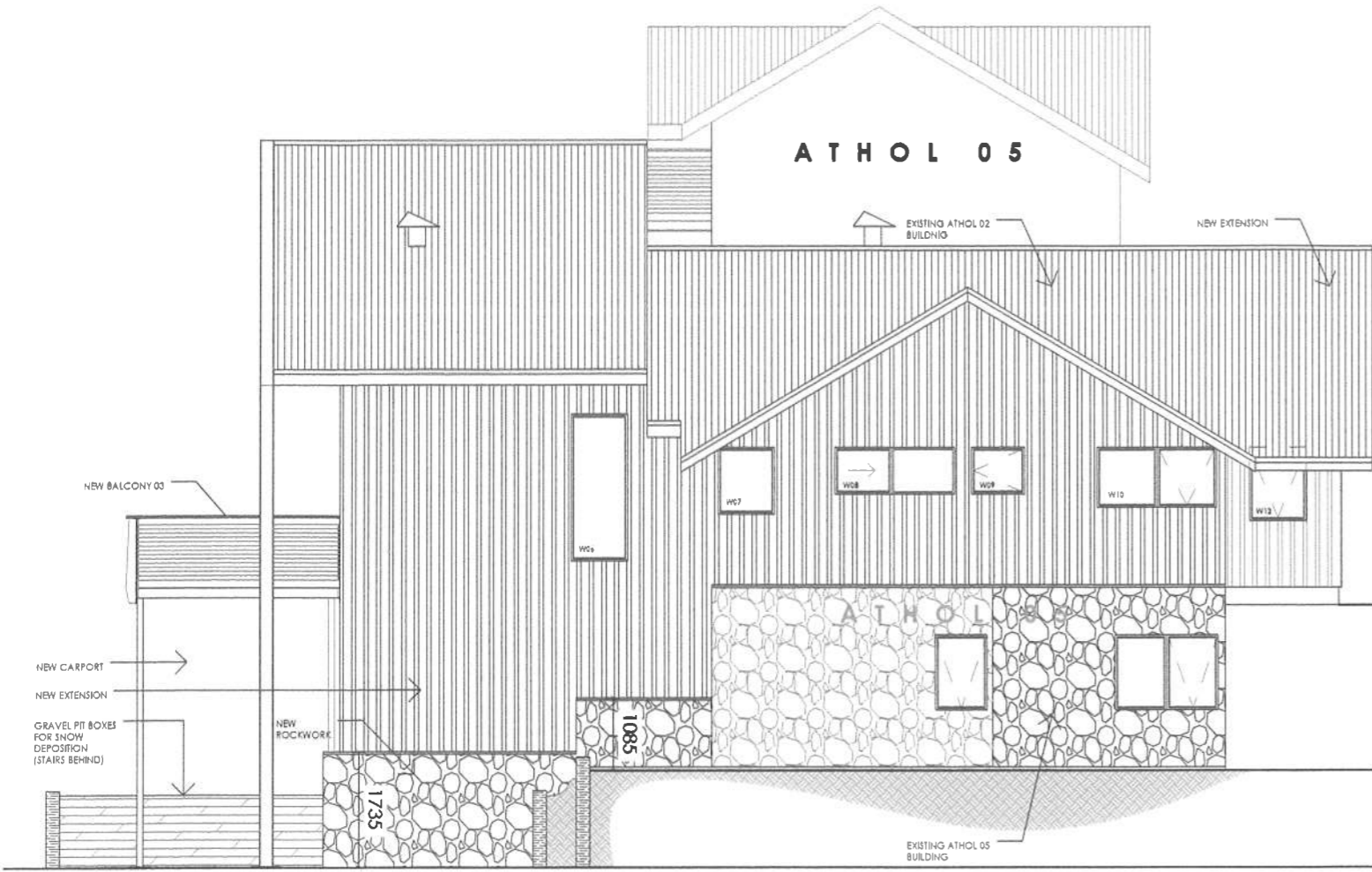
WEST SIDE ELEVATION